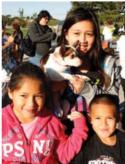
Young participants in Emancipet's rabies drive

Sterilization is a cornerstone of the campaign. Last year, the ASPCA awarded