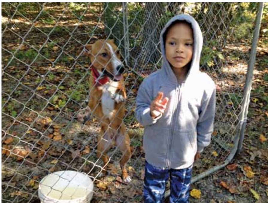
Six-year-old Gentry and one-year-old Brownie now have a safe place where they can play together with the help of the Coalition to Unchain Dogs.